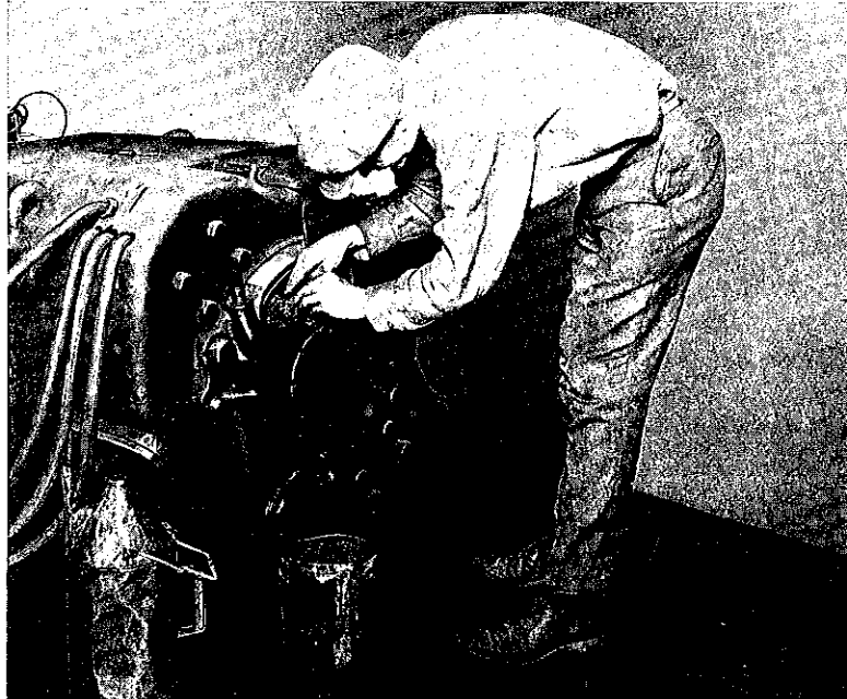
Packing a Railway Motor Bearing

Railway motor bearings are all of the sleeve type with the exception of a few small motors which have armature bearings of the ball or roller type. Lubrication is provided by means of waste and oil; proper lubrication and care of bearings is something which cannot be over emphasized. In addition to serving their usual function, axle bearings must also support a considerable part of the weight of the motor.